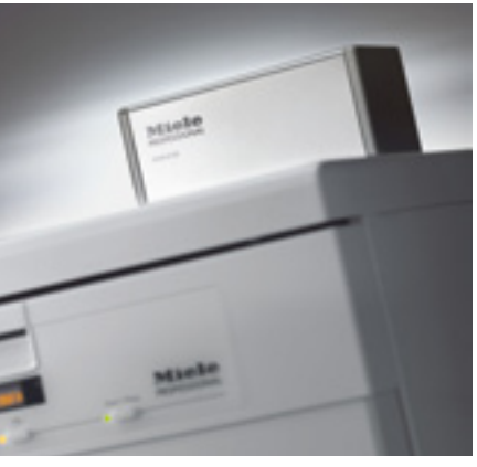
Automatic dispensing of liquid detergent Dispensing liquid detergent via an external

In the 'ECO' programme, ProfiLine dishwashers* are even 30% more efficient in terms of water and electricity use than their predecessors and even achieve an A+ for energy efficiency.