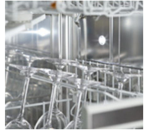
Perfect illumination for easier loading 4 powerful LEDs immerse the dishwasher interior in brilliant light. The area in front of the dishwasher is also well lit, significantly improving loading and unloading. Even baskets pulled out for loading and unloading are brightly lit - a particular benefit in a dimly lit kitchen.

1) Patent DE 10 2008 062 761 B3 2) European patent EP 1 080 681 3) European patent EP 1 457 153 B 4) Patent DE 10 2007 008 950.5